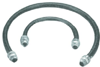
防水軟管 FEC TYPE